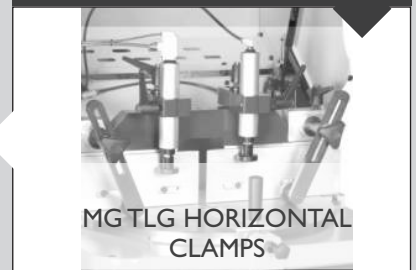
MG TLG HORIZONTAL CLAMPS