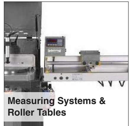
Measuring Systems & Roller Tables