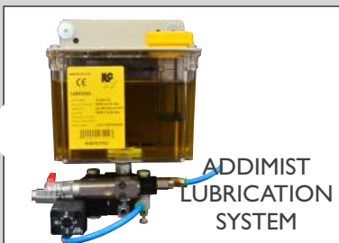
ADDIMIST LUBRICATION SYSTEM