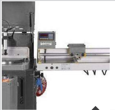
MG AUTOPOS MEASURING SYSTEM