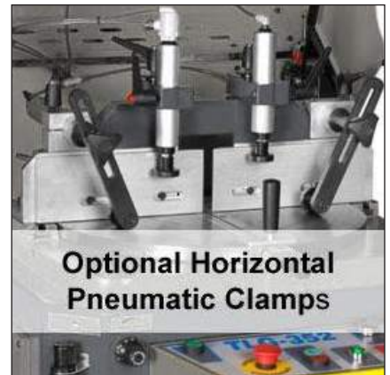
Optional Horizontal Pneumatic Clamps