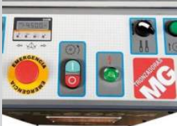
MG DIGITAL ANGLE DISPLAY

Digital display of the cutting angle, accurate to 0.1 degree (factory fit option)