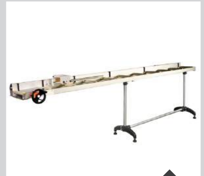
MG TM-MEASURING SYSTEM