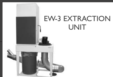
EW-3 EXTRACTION UNIT