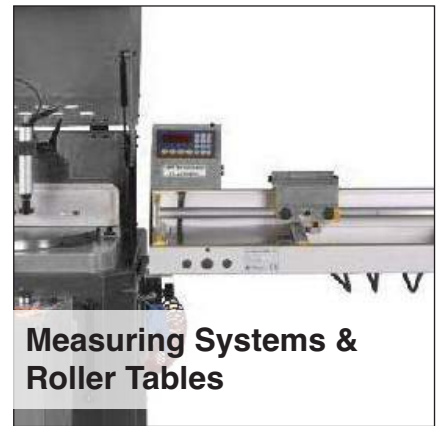
Measuring Systems & Roller Tables