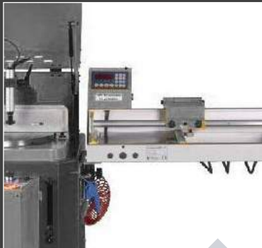
MG AUTOPOS MEASURING SYSTEM