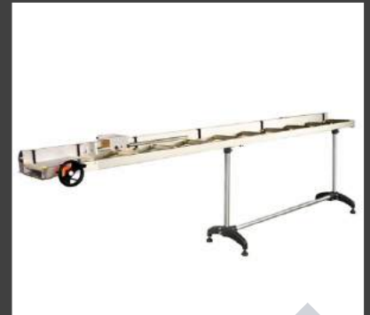
MG TM-MEASURING SYSTEM