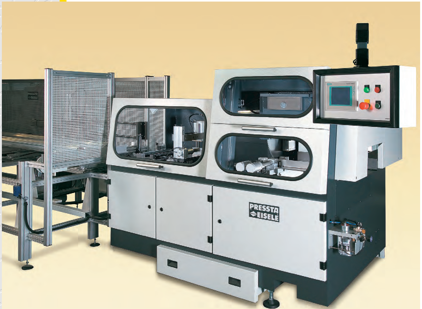
Automatic Circular Saw Profilma 600 R with horizontal cross loader

For Aluminium and non-ferrous heavy metal