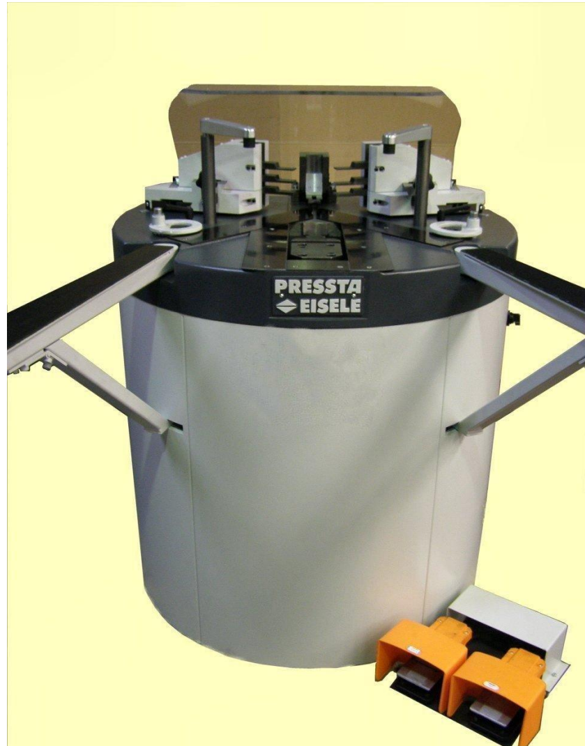
Corner Crimping Machine Pressta 7000