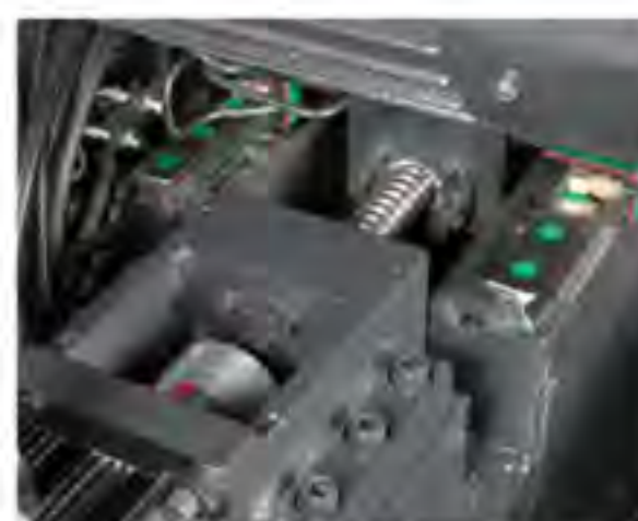
Controlled accurateness through servo motor and ball screw