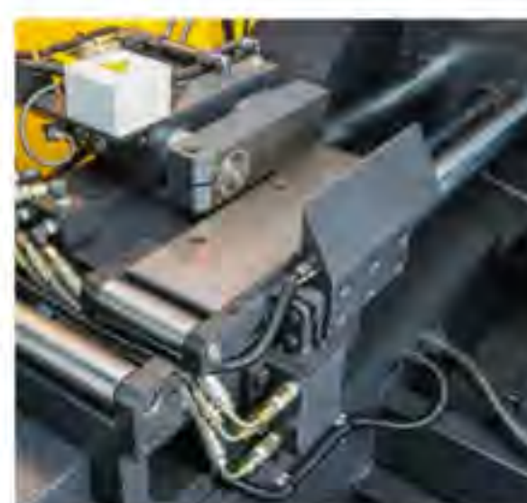
Shuttle floating system