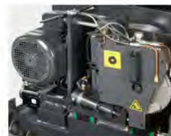
Direct driven saw head for high cutting performance