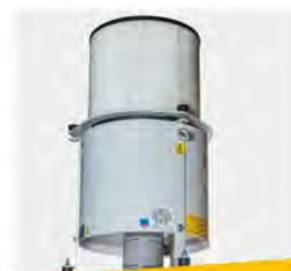
Air Filter (Opt.)