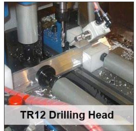
TR12 Drilling Head