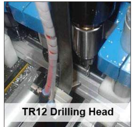
TR12 Drilling Head