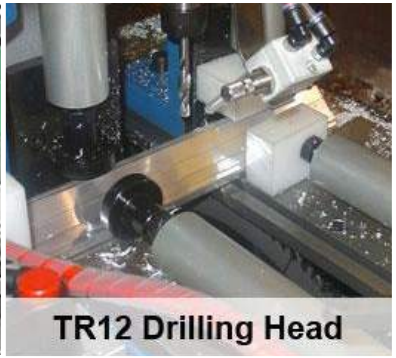
TR12 Drilling Head

Available as a factory order the GAA range can be fitted with either TR12 / TR20 drilling heads or bespoke punching heads to produce completed components. These can be mounted vertically, horizontally or both with manual adjustment on the pneumatic GAA version for altering centre lines. The GAA - CNC models have the option for Y axis NC movement which offers flexible manufacturing options.