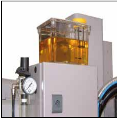
Minimal lubrication system (optional)