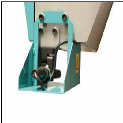
Laser ray (optional)

Blade speed variator with inverter for a speed range of 18-100m / min.