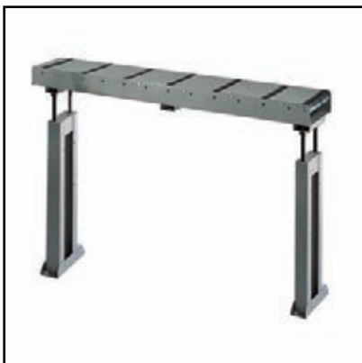
Loading/unloading table (Optional)