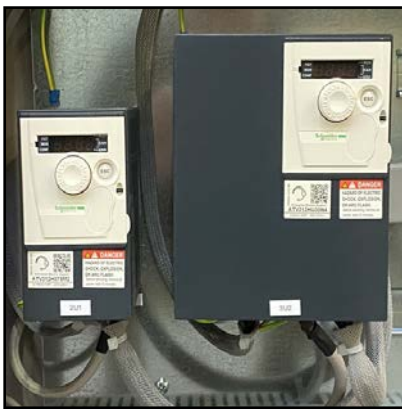
Inverter speed variator (Optional)

It is possible to request for any type of machine the minimum lubrication which eliminates the dispersion of coolant typical in the use of emulsifiable oil, the duration of the blade is not affected .