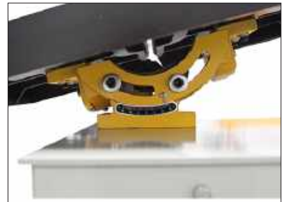
Tilting table for bevel / mitre cuts

VERTICAL VARIABLE SPEED BANDSAW SUITABLE FOR THE GENERAL WORKSHOP